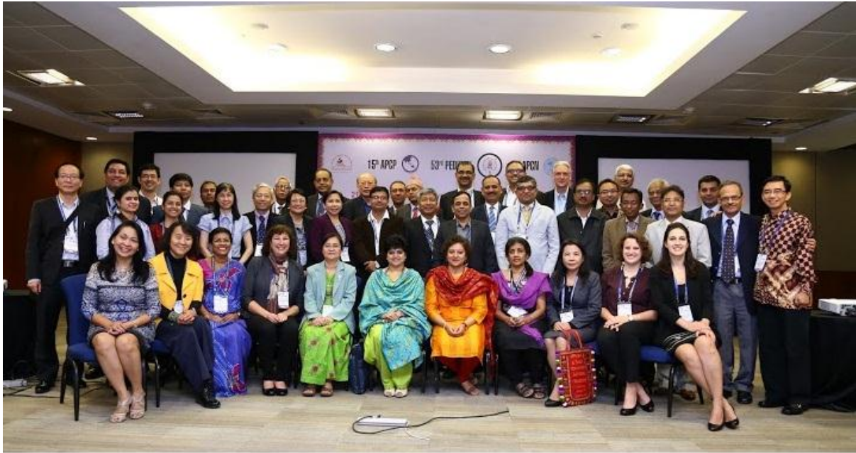
APPA, Gavi and Partners Immunization Advocacy Workshop on 20th and 21st January, 2016 at Hyderabad, Telangana