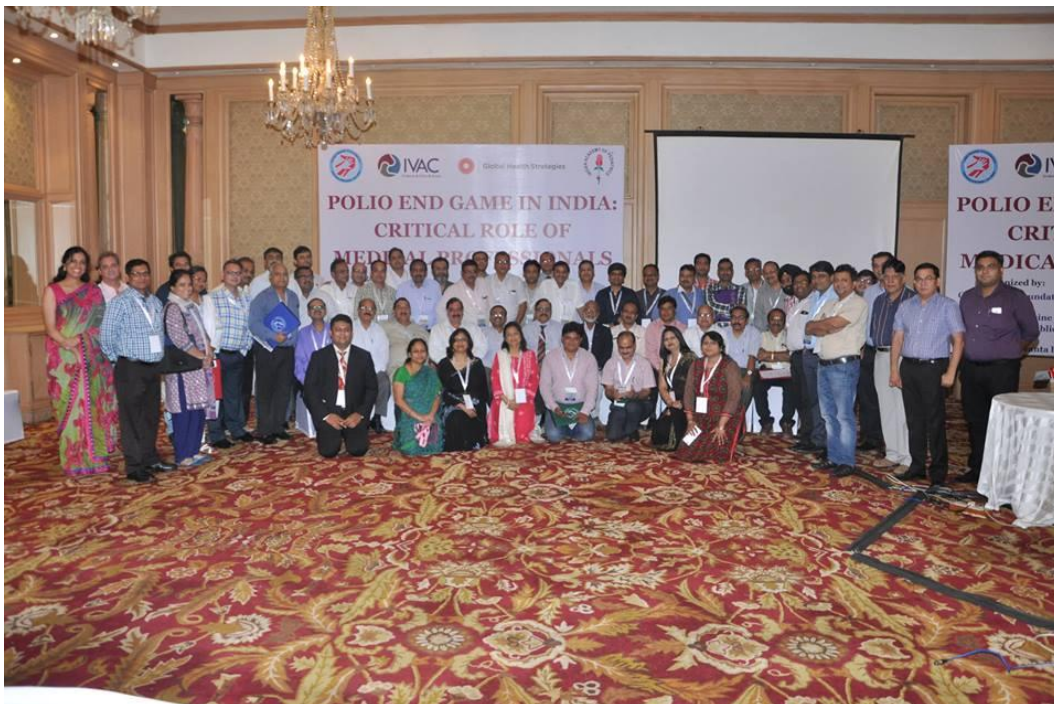
Technical consultation on “Polio End Game in India: Critical Role of Medical Professionals” supported by UNICEF India

These messages to be conveyed at all opportunity.